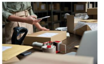
Transport & Logistic