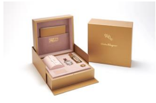
Fashion & Luxury