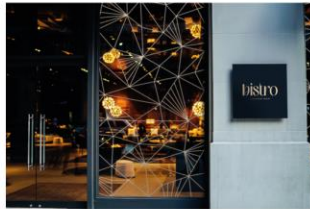
Advertising & Promotion