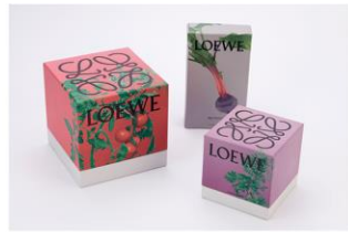
Beauty & Personal Care