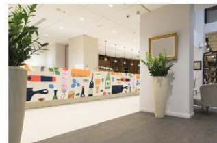
Architecture & Design