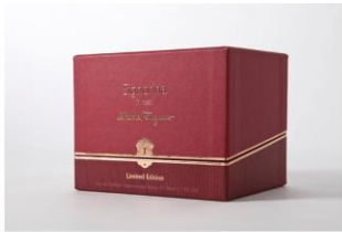
Jewelry & Watches