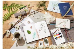
Art & Drawings