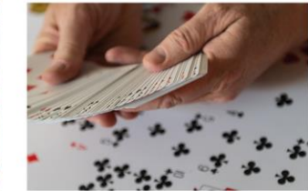
Games & Playing Cards