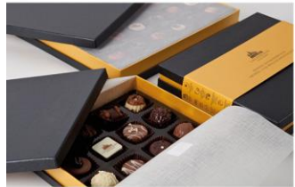
Food & Beverage