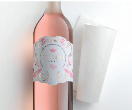
RE-PLAY: the revolutionary innovation that turns liner into premium labels

Recycling. Any recovery activity where waste materials are reprocessed to get products or substances, either for their original or other uses. It covers reprocessing of organic material (e.g., composting), although not including energy recovery for fuel purposes or for backfilling applications.